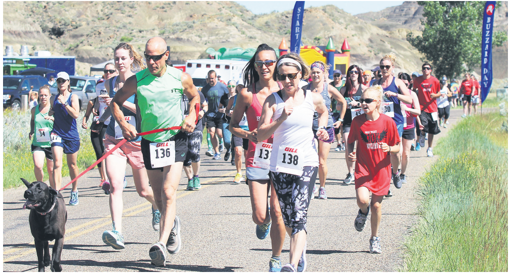
Above: Runners take off for the Buzzard Day 5k/10k race.

And when you’re in Glendive, you’re not in the middle of nowhere. We like to say that we’re “in the middle of everywhere!” Theodore Roosevelt National Park is less than an hour to the east down I-94. The Black Hills, Mount Rushmore, Deadwood, Sturgis, Devil’s Tower, Fort Peck Lake, the Little Bighorn Battlefield and the world-class trout fishing of the Bighorn River are all within a 2-3 hour drive from Glendive. Yellowstone National Park is reachable within about 5-6 hours. No matter which direction you go, there’s plenty of places and things to explore, see and do within a short driving distance of Glendive.