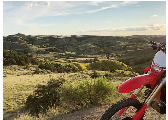
Right: Short Pines OHV Area offers a thrilling challenge for riders.