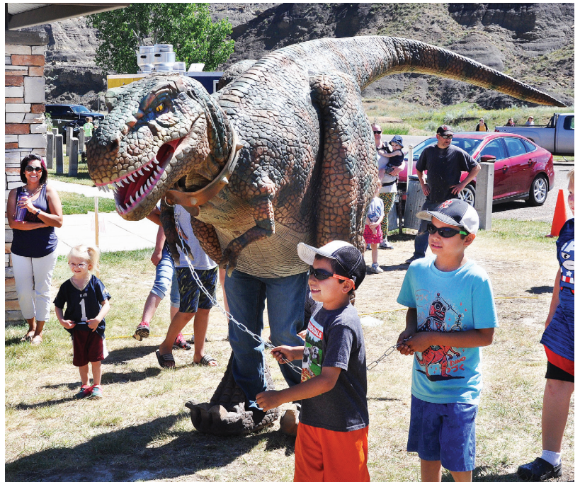
Top: Kids take a turn leading around Makoshika State Park mascot "Mak."

Outside of school and school-sponsored activities, there's so much more for kids to do, enjoy and learn here in Glendive. Youth sports programs are a major part of community life. Glendive has a robust system of baseball/softball leagues for kids of all ages and a long love affair with the sport. Or if your child has an aptitude for swimming, they may want to join the Wet Devils Swim Team. Or they may want to play in the fall youth soccer league. Or maybe they just want to grab a frisbee and go out with their friends to play disc golf at Makoshika's Professional