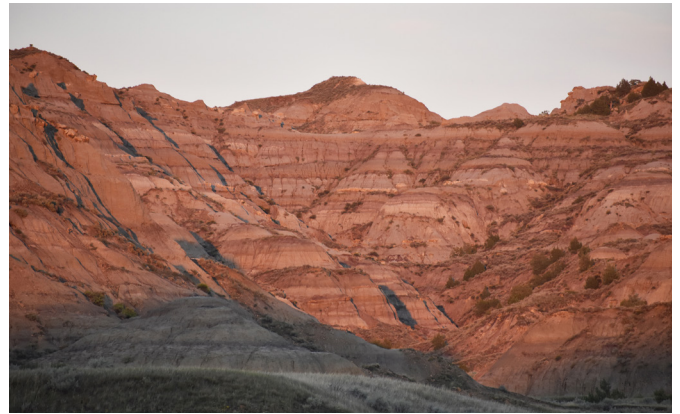
Right: Makoshika's badlands change colors with the light, often taking on a pinkish hue at sunset.

It's hard to know where to begin describing everything that Glendive has to offer for outdoor recreation, relaxation and family fun.