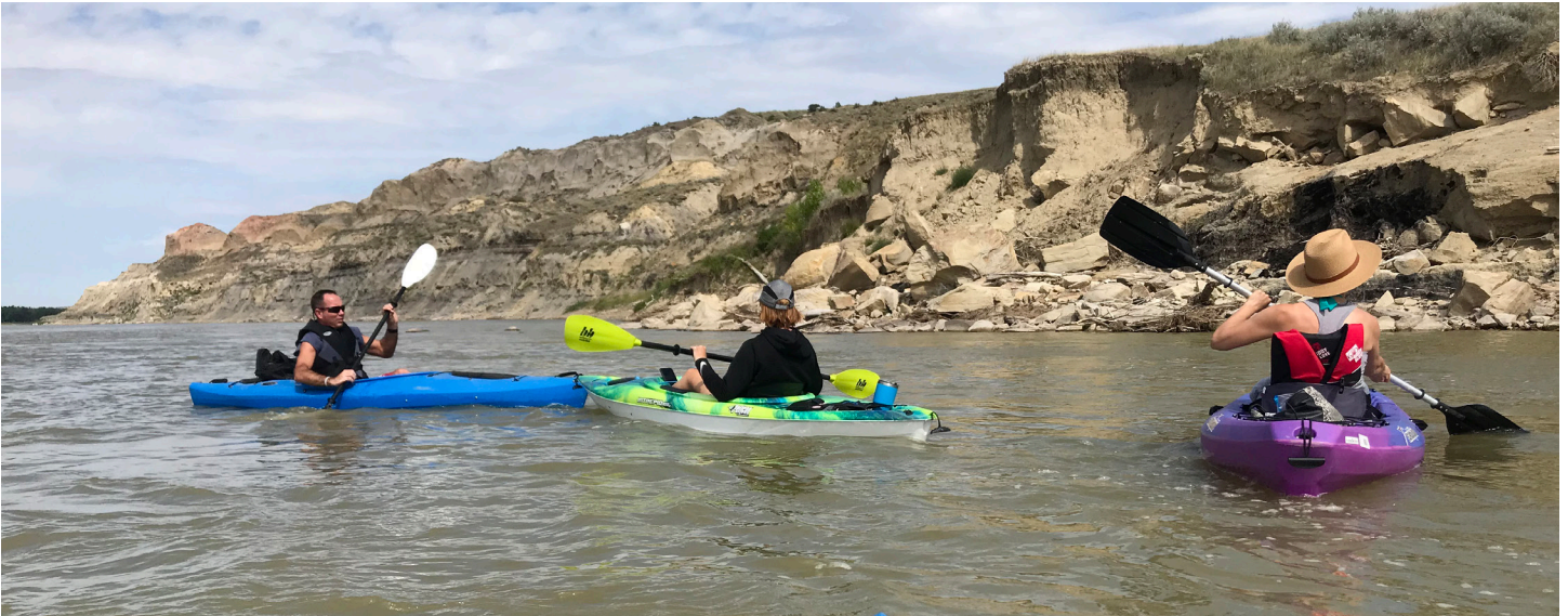
Above: Kayakers paddle past high bluffs on the Yellowstone downstream from Glendive.