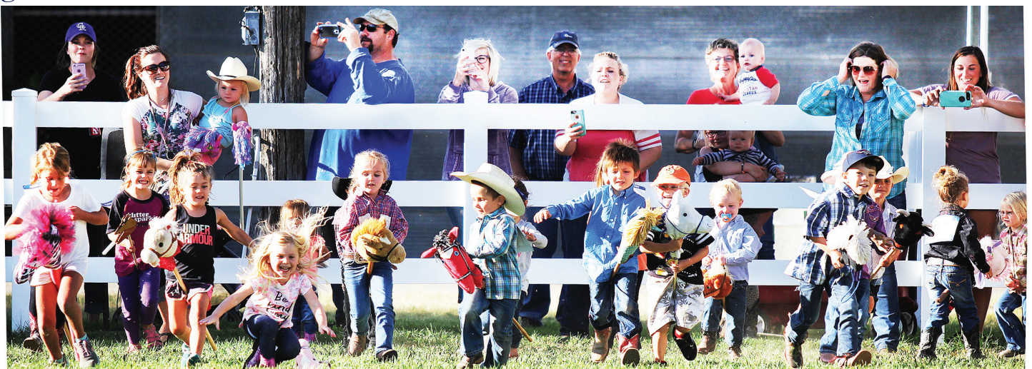
Bottom: Youngsters take off in the stick horse race to kick off the Dawson County Fair.