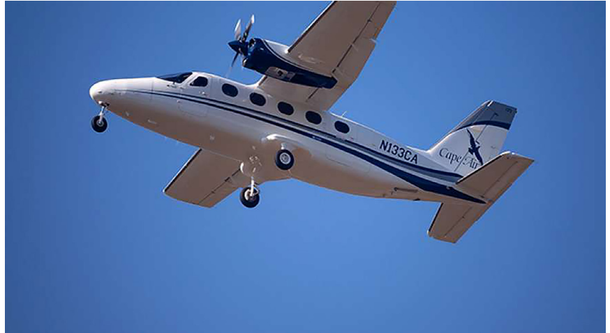
Cape Air provides twice-daily passenger air service between Glendive and Billings Logan International Airport.

For manufacturers, Glendive may seem well off the beaten path from where major manufacturing facilities are typically placed, but in this industry too, Glendive presents advantages and opportunities. Again, our outstanding freight transportation links will allow you to get your manufactured goods where they need to go quickly and efficiently. Glendive also has the ability to produce highly-skilled, highly-dedicated workers to serve your industry. Dawson County High School boasts a robust and growing Career and Technical Education program to help provide the next generation of our workforce with excellent trade skills and mechanical skills. Dawson Community College offers area students access to post-secondary education and career and technical training programs to create even better-skilled workers to meet your workforce needs. DCC's welding program and corrosion technology program in particular dovetail especially well