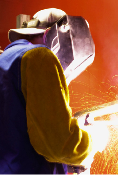
Dawson Community College's welding program can help supply skilled workers for manufacturers.

with the skills manufacturers are looking for in their workforce. And while, with its current size, Glendive may not be able to provide all the workers you need to staff your facility, any existing employees you bring with you or new employees you hire from outside the region are sure to find living and working in Glendive a pleasant surprise, with affordable home prices, space between neighbors, good quality schools, clean air, zero traffic congestion and outstanding outdoor recreation opportunities amongst those things they're likely to appreciate.