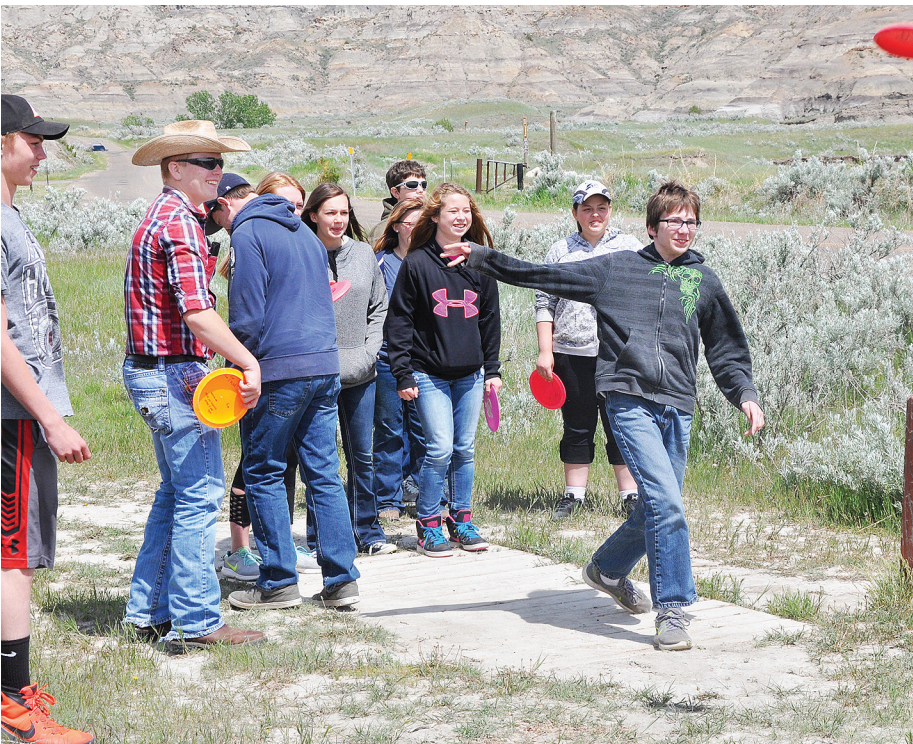
Left: A group of teens play disc golf on Makoshika's PDGA-sanctioned course.

Disc Golf Association-sanctioned course.